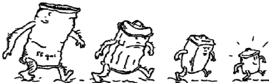
The Evolution of the waste can